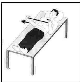
Supine external rotation

Lie on your back. Hold the affected arm at the elbow with the opposite hand. Assisting with the opposite arm, lift the operated arm upward, as if to bring the arm overhead. Slowly lower the arm back to the bed.